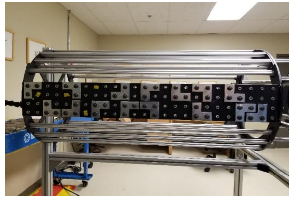
Figure 2. Assembly jig designed at ETS

illustrated in (Figure 2). Before beginning with each participant, a brief tutorial on how to use the tools and components was provided. The participants had to select the appropriate bolts between the two types provided based on the instructions. For the first two scenarios, both the instructions and an image of the final assembly were printed on paper and attached to the jig above the plate they needed to work on. For the third and fourth scenario, the same instructions and image of the final assembly were only provided in smart glasses. During all scenarios, participants were filmed for upper limb movements with 2 GoPro Hero 3+ cameras which were located on the jig on both sides of the participant, and the time was measured with a chronometer and confirmed by the cameras. A Pupil-labs core eyetracker was also used to track eye movements.