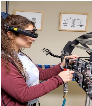
Figure 1. Assembly of brackets on a simulated plane engine using smart glasses

Each participant completed a NASA-TLX survey at the end of the experiment which assessed the subjective workload experienced while doing tasks. Also, each participant's specific comment on the tasks and usage of smart glasses were documented.