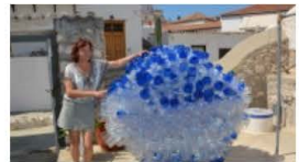
Μια ιδιαίτερη σφαίρα θα κυλήσει στους δρόμους της Ύδρας