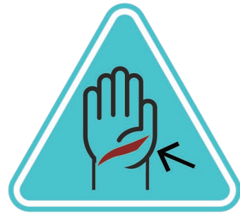
INJECTION OR PUNCTURE WOUND