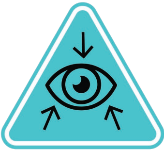
ABSORPTION (through eyes, mucosa, and/or skin)

Exposure to biohazards can happen in the following ways: