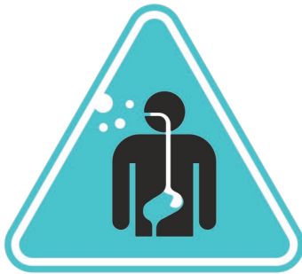
INGESTION (through mouth)