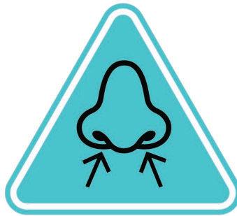
INHALATION (through nose and/or mouth)